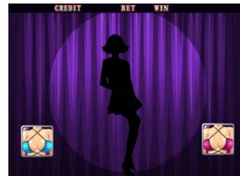
DOUBLE-UP (For All Games)